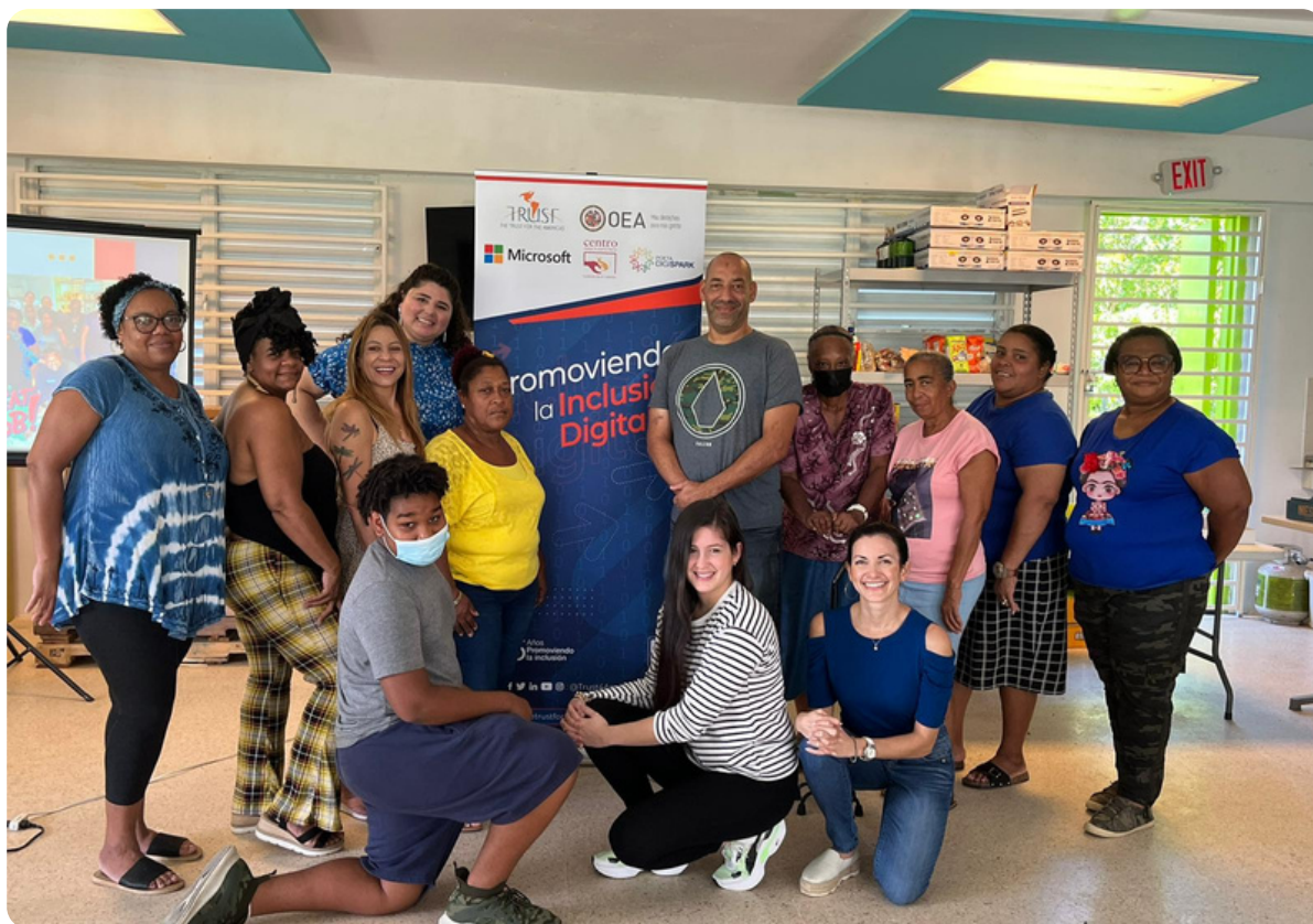
Members of La 23 Community in Loíza with the POETA DigiSpark project team.

1,354 Participants Certified in Digital Skills