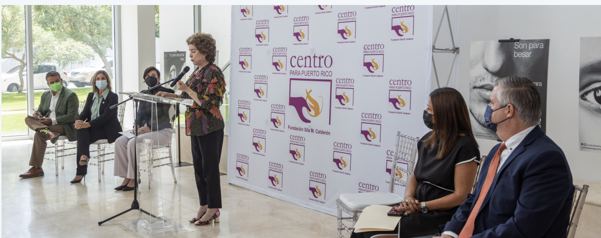
Ce-Transforma inaugural ceremony in 2022.

Ce-Transforma is an example of the power of alliances. It demonstrates what happens when the public and private sectors join forces to confront social problems. Funding from the Puerto Rico Department of Justice, the Puerto Rico Fiscal Agency and Financial Advisory Authority, the Prevention, Support, Rescue and Education Committee on Gender Violence (PARE) was crucial.