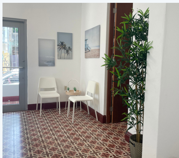
Service facilities in a remodeled building near the Center for Puerto Rico in Río Piedras.