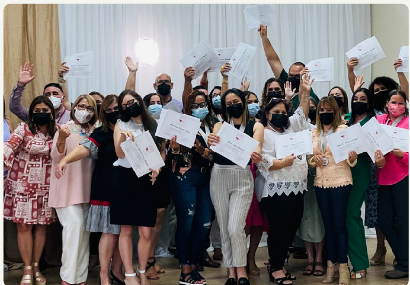
Community Entrepreneurial Training closing ceremony in Lares.

The COVID-19 pandemic forced us to adapt our approach, replacing in-person meetings with online workshops and technical support sessions. Despite this challenge, we achieved a good program retention rate, provided a substantial number of hours of consulting services, completed multiple programs, and organized entrepreneurial activities such as bazaars in shopping malls and media interviews.